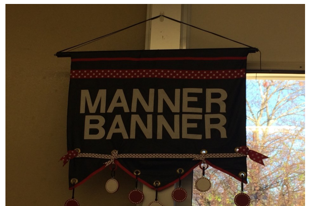
The prestigious "Manner Banner"