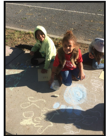
Charles Street School first graders preparing for the chalk walk!